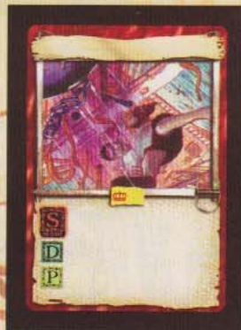
Grape Shot 2-11