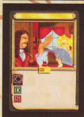
Posh Quarters 2-15