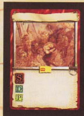
Chain Shot 2-12