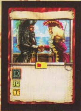
Foil Betrayal (30 plunder) 2-10