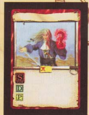
Scarlet Hook of Madness 2-13