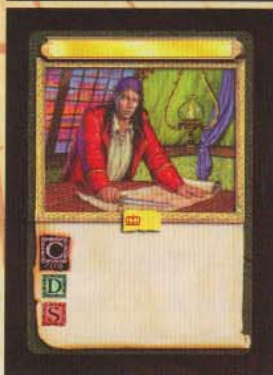
Captain's Quarters 2-14